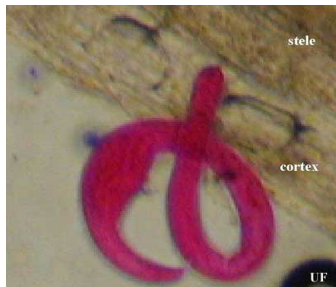
Figure 1. Young female of reniform nematode, Rotylenchulus reniformis Linford & Oliveira, with swollen body. The female penetrates the root of cowpea and the anterior portion (head region) of the body remains embedded in the root whereas the posterior portion (tail region) protrudes from the root surface.

Rotylenchulus reniformis is largely distributed in tropical, subtropical and in warm temperate zones in South America, North America, the Caribbean Basin, Africa, southern Europe, the Middle East, Asia, Australia, and the Pacific (Ayala and Ramirez 1964).