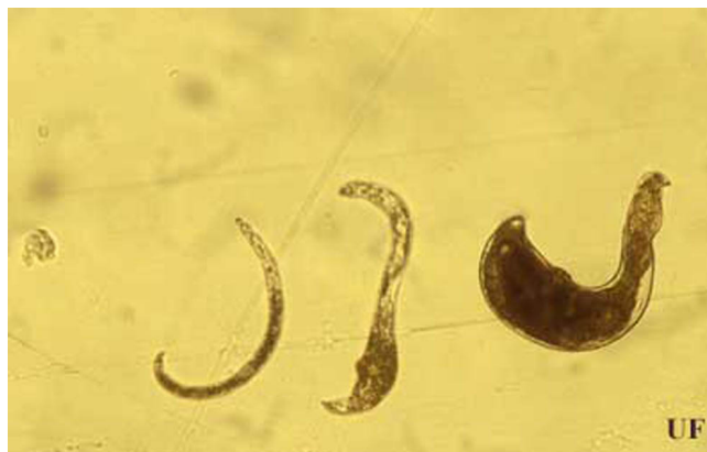
Figure 2. Life stages of reniform nematode, Rotylenchulus reniformis Linford & Oliveira. Ranging from left to right is egg, juvenile, young female with swollen body, and mature female in kidney shape.