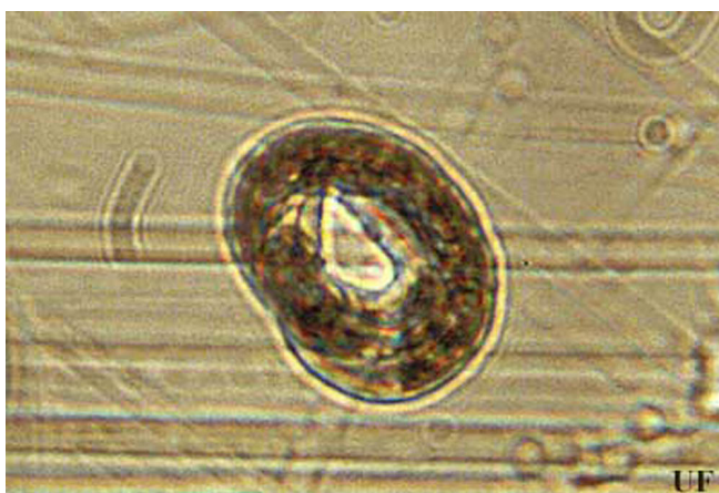
Figure 4. Reniform nematode, Rotylenchulus reniformis Linford & Oliveira, tightly coiled to undergo anhydrobiosis under drought conditions.

length posterior to the base of stylet knobs. The basal glands overlap the intestine laterally, or less often ventrally. The vulva is post-median ( V > 63\% ). The female reproductive system is amphidelphic with two flexures in immature females and highly convoluted in mature females. The female tail is usually more than twice the anal body diameter. The juvenile tail tapers to a narrow, rounded terminus with about 20 to 24 annules. Phasmids are porelike, about the body width or less behind anus. Males have weak stylets and stylet knobs, a reduced esophagus, and an indistinct median bulb and valve. Caudal alae are adanal. The lateral field of males, young females, and juveniles has four incisures which are not areolated (Mai and Mullin 1996).