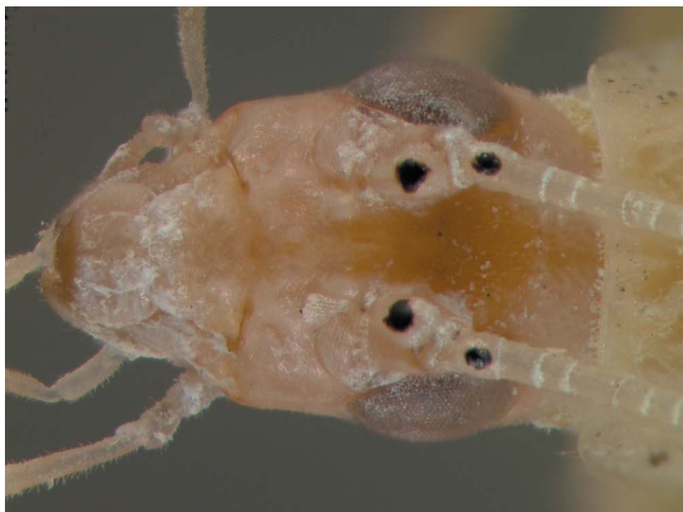
Fig. 1. Antennal markings of holotype of O. alexanderi . For color version, see Plate XIV.

In Fig. 3, the five determinations of chirp rates for Mexican O. alexanderi are by RDA as given to TW in 1966 and are from Michoacan (Tuxpan), Tamaulipas (Ciudad Victoria), and San Luis